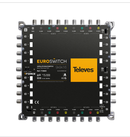
Televes reserves the right to modify the product