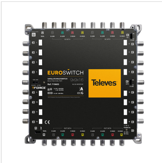
Televes reserves the right to modify the product