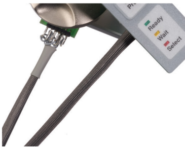
Protect component wiring leads from heat and abrasion with Insultherm Tru-Fit for an attractive and permanent finish.

Insultherm Tru-Fit provides a sturdy, long lasting, and inexpensive insulation solution. It is flexible and expandable, and can easily be installed over applications with irregular shapes and tight turns. Standard colors are Black and Natural, but other colors are available by special order. Contact your account representative for details.