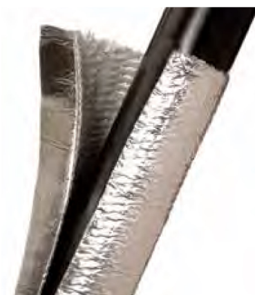
T6 is shipped in pre-cut 4' lengths

T6 can reduce the heat transmission from hot pipes or engine components into hoses or harnesses by up to 50% or more.