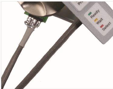
Protect component wiring leads from heat and abrasion with Insultherm Tru-Fit for an attractive and permanent finish.

Insultherm Tru-Fit provides a sturdy, long lasting, and inexpensive insulation solution. It is flexible and expandable, and can easily be installed over applications with irregular shapes and tight turns. Standard colors are Black and Natural, but other colors are available by special order. Contact your account representative for details.