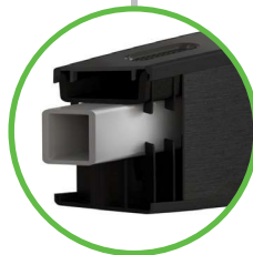
Precision-engineered, ultra-strong, solid steel frame provides maximum support