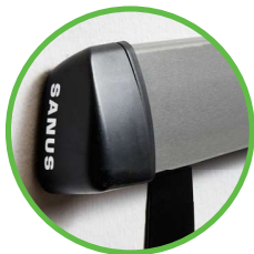
Stylish brushed metal exterior seamlessly blends with TV and décor