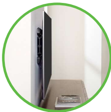
Slim full-motion mount sits just 2.15" from the wall in home position accentuating the sleek look of ultra-thin TVs