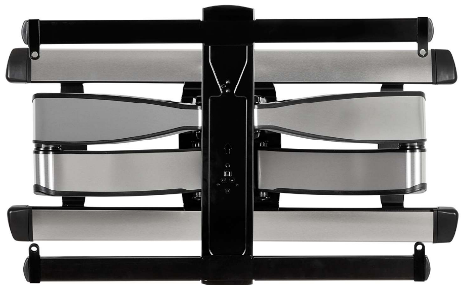
BRUSHED SILVER STAINLESS