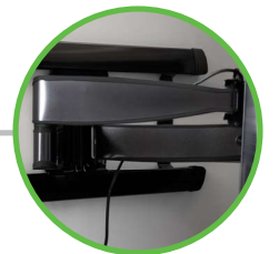
In-arm cable management creates a clean look