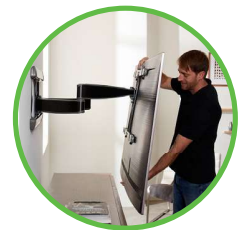
Virtual Axis™ provides fingertip tilt