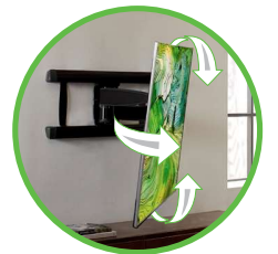
FluidMotion™ design provides effortless TV movement