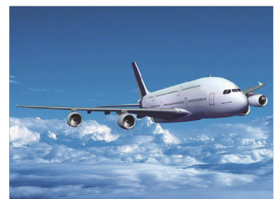
Accepted for use by major aircraft manufacturers.