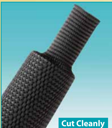
Cut Cleanly Scissor