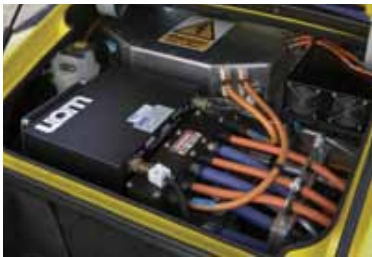
Tomorrow's electric vehicles are more compact with higher power. Flex Glass FR is design to control up to 7,000 volts in tight spaces safely and efficiently.

SF sleeving is rated to 392°F. (Class H), is abrasion resistant, and maintains it's flexibility in low temperature environments. It is available in a very wide range of sizes, and is ideal for use in appliance assemblies, wire harnesses, transformer leads, power supplies, motor coil and heater leads.