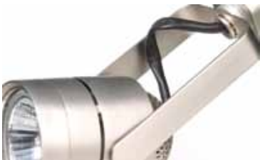
High temperature fiberglass base material makes Flex Glass a great solution for demanding lighting applications.

Acrylic Flex Glass is used in applications such as relays, radio circuits, transformers, and lead/crossover protection on motors. Highly resistant to acids and solvents, and will withstand tough assembly handling. AG sleeving is recommended for thermal requirements from -13°F to 311°F ranges.