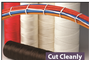
Cut Cleanly Scissors

Cable lacing - easy to learn, quite inexpensive, looks more attractive, and is a superior method of bundling wires in your boat.