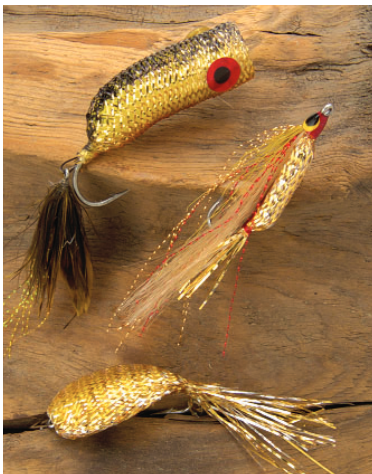
Light weight and economy make MY an ideal product for designing and tying fishing lures of all types and sizes. Several world records have been set with lures constructed with Techflex sleeving.