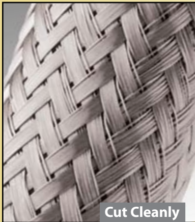
Cut Cleanly Shears