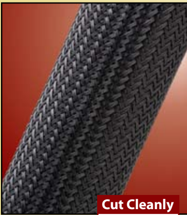
Cut Cleanly Hot Knife