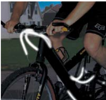
Under low light conditions, the retroreflective strands in FLEXO Reflex sleeving reflect light up to 1,500 times more efficiently than bright white sleeving.