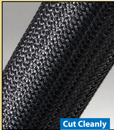
Cut Cleanly Scissors