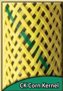
CK Corn Kernel