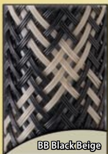
BB Black Beige

Red, Orange, Black, Blue, Yellow, Green and Gray Spirals