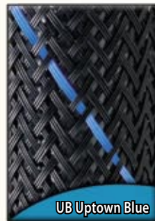
UB Uptown Blue