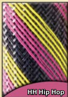
HH Hip Hop

Clear with Black, Neon Yellow and Neon Red Spiral