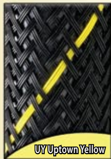
UY Uptown Yellow