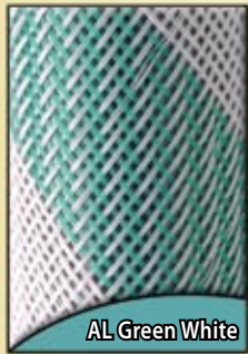
AL Green White