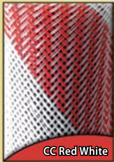
CC Red White