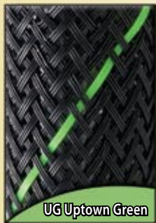
UG Uptown Green