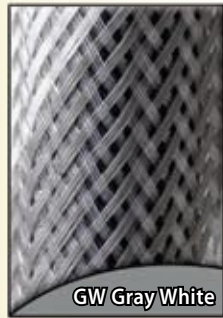
GW Gray White