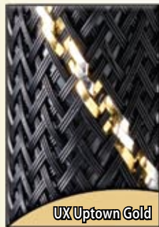
UX Uptown Gold