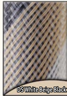
DS White Beige Black