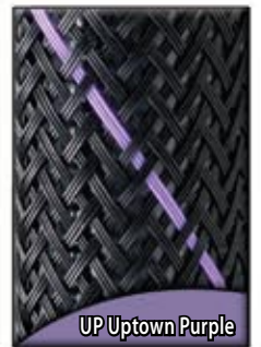
UP Uptown Purple