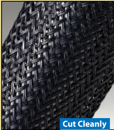
Cut Cleanly Hot Knife