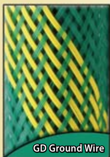
GD Ground Wire