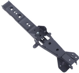
2 – Antenna bracket