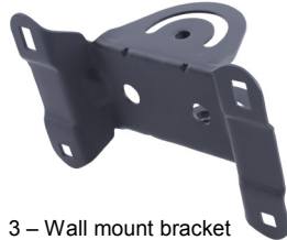
3 – Wall mount bracket